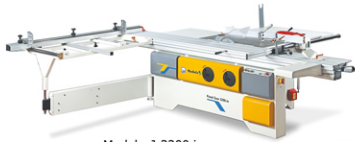
Model : J-3200.in