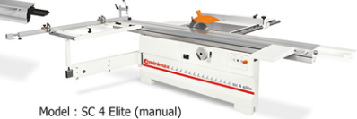
Model : SC 4 Elite (manual)