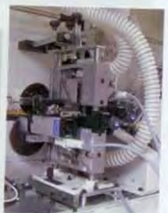
Tiltable Top & Bottom Trimming