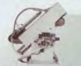
End Cutting Unit