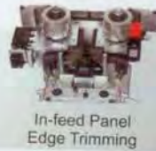
In-feed Panel Edge Trimming