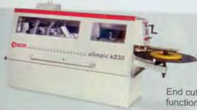
End cutting unit with "Radius" function in a single operation