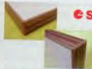
Example with radius function

e scm Olimpic K-230 / K-230 & K-230 T with Radius