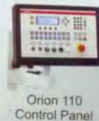
Orion 110 Control Panel